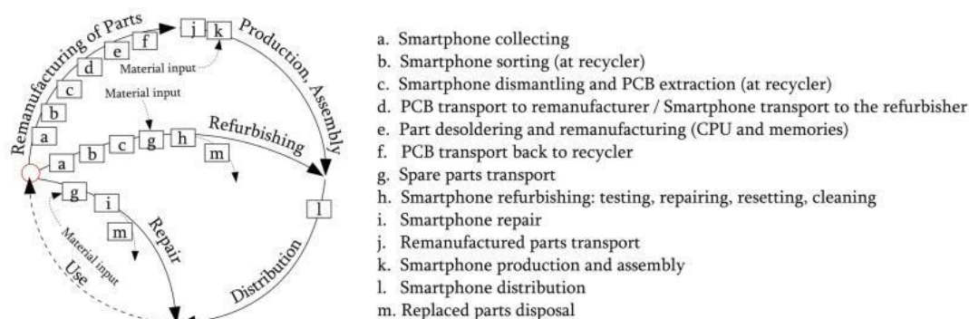
Fig. 4 End-of-use scenarios repair, refurbishing and remanufacturing and their process steps

GWP was the main measure of environmental impact with CO 2 eq or carbon emissions being the key metric, as one of the main contributors to environmental damage.