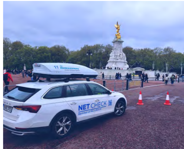
NET CHECK drive testing

The measurement technicians drove 24 routes in the measurement vehicles and covered a measurement distance of over 1,109 kilometres .